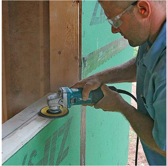
Create your own sloped sill. Remove stock from the rough sill to provide drainage in the case of leaks. Draw one line 3 in. from the outside face of the opening, and another about ½ in. down from its outside edge. To create the slope, use an angle grinder equipped with a rough-grit flap disk.