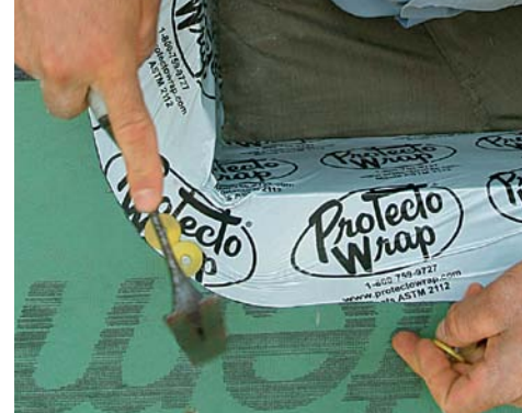
Continuous outside corners. You can buy flashing tapes made for curves, but they're expensive. Protecto Wrap tape is far more affordable and has enough flexibility to be stretched down onto the sheathing, where I tack it in place with button-cap nails.