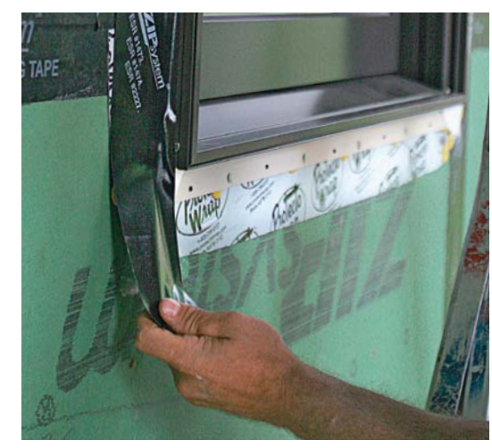
Reinforce the fin. Zip System Tape is 3^{3}/4 in. wide, which is wide enough for it to be adhered to the sheathing, across the nailing fin, and onto the side of the window frame.