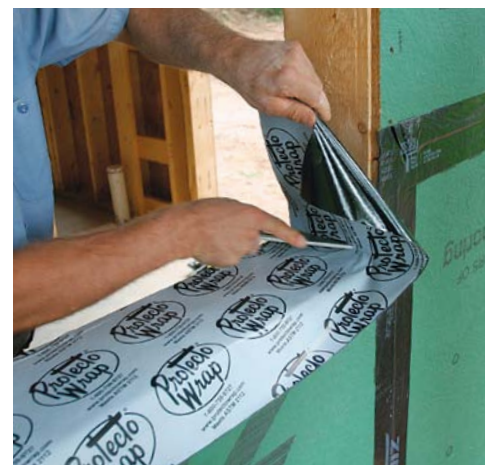
Keep the transition tight. Use a rafter square to press the tape tightly into the corners where the sill meets the sides of the rough opening, eliminating bubbles under the tape that are vulnerable to puncturing.