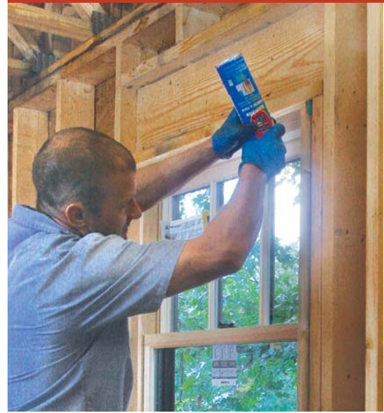
A conservative bead of foam. A thin bead of lowexpansion spray foam offers limited air-sealing and insulation, but avoid filling the entire cavity, especially toward the bottom, to allow for drainage in the case of water entry.