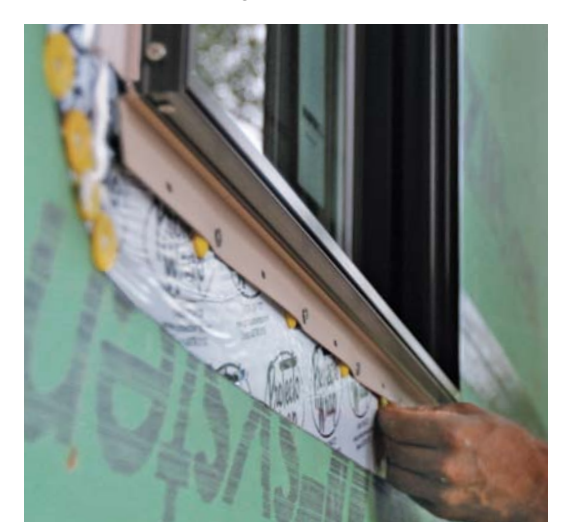
Caps make a gap. To promote drainage, slide caps from button-cap nails under the bottom nailing fin, pressure-fitting one next to each nail. These caps are thick enough to create a gap but not so thick that they will complicate trim installation.