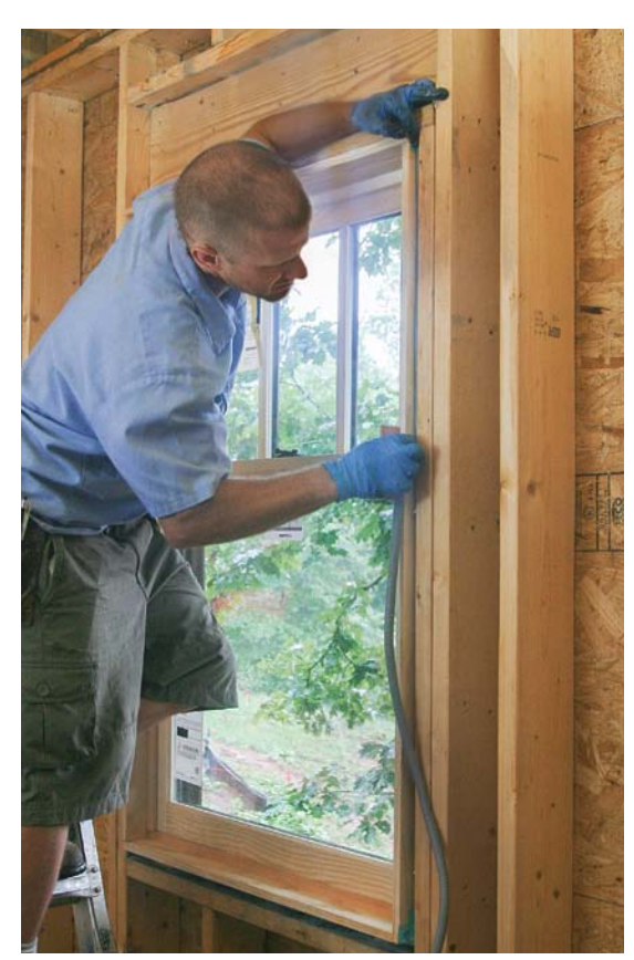
A caulk joint that will last. Foam backer rod cut and pressed in around the window jamb creates a flexible base for the bead of caulk that follows it. Use a wet finger to smooth the bead against the backer rod, creating the ideal hour-glass shape that allows the sealant to expand and contract without cracking or debonding.