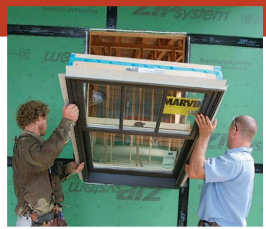
Bottom first. Rest the window on the edge of the sill, tip it upright, and slide it straight in against the caulked sheathing.