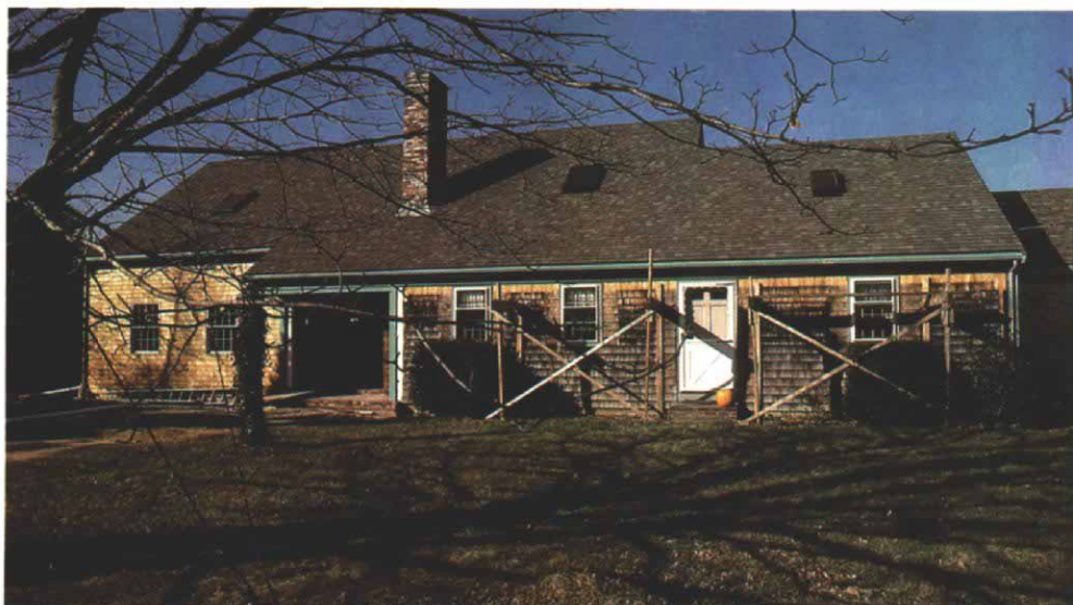
The finished house, seen from the front, appears smaller than it actually is because the extended roofline obscures the new 40-ft. shed dormer at the back of the house.