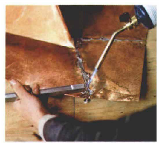
McBride solders the flashing in his shop, instead of on the roof. This way he can position the flashing so that the seams are level when he solders them, which keeps the molten solder from running out of the joint.

Installation—Before cloaking the wooden cricket in its copper cape, I shingled up the sides of the chimney structure, inserting step flashing as I went. When I got up to the back