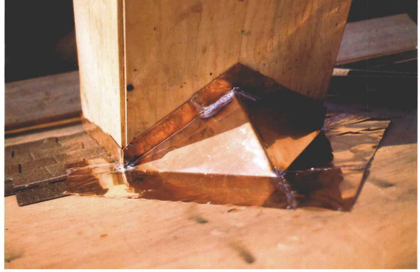
Building and flashing a cricket are the same whether for a masonry chimney or for a wooden chimney structure like the one above, which houses a pair of woodstove chimney pipes. Other metals will work for the hashing, but copper is the easiest to solder.