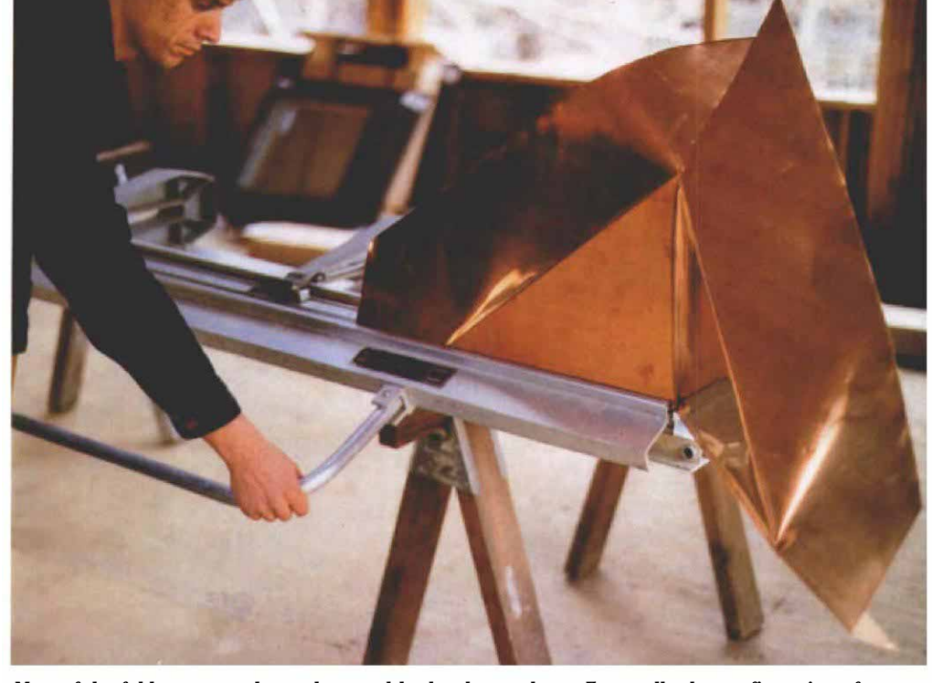
Most of the folds were made on the metal brake shown above. Eventually the configuration of bends prevented the roof sheet from slipping into the brake, so the final folds were handmade.

After adjusting the torch to burn with a sharp blue flame about 1 ½-in. long, I use a circular motion and play the tip of the flame over a broad area to warm up the copper a