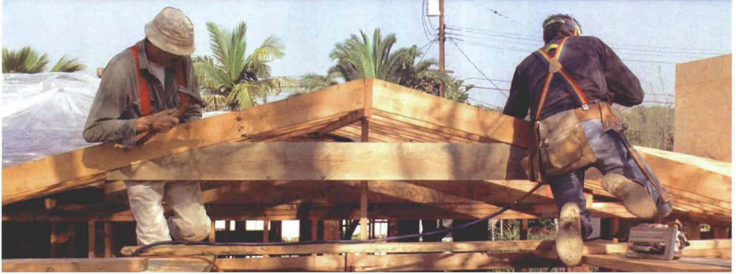
The Dutch ridge is nailed between the first pair of gable-common rafters. After striking a chalkline to position the top of the Dutch ridge, the author and his brother nail the 2x10 ridge between and under the 2x8 gable commons. The Dutch-common rafters hang from this Dutch ridge.