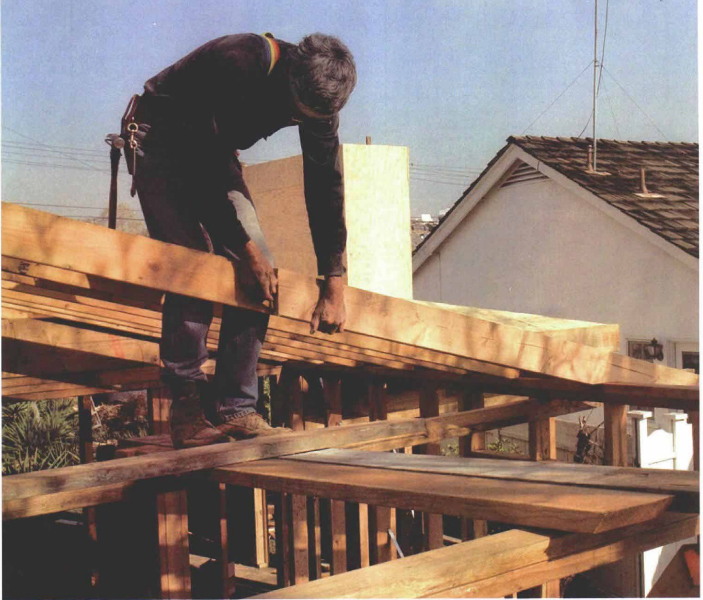
Use the Dutch commons to locate the Dutch ridge. Using a Dutch-common rafter as a template, the author marks its plumb cut on the first gable common. After the opposing gable common is marked, the Dutch ridge will sit even with the top of these lines.

the plumb lines with a hip-rafter template. (A rafter template is like a short rafter in that it's got the ridge cut, the bird's mouth and the rafter tail all on a piece of 1x the same width as the rafter but only about 2-ft. long. I make templates for each type of rafter in a roof.) The ridge plumb cut can be a 45° cheek cut or a double-side cut: two 45° plumb cuts that form a point. I've never been convinced that one cut is better than the other, but on this roof I made a double-side cut just for the sheer enjoyment. To make this cut, I use the tongue of the framing square to mark a second plumb-cut line 1½ in. away from the first one. With the saw set at 45°, I make the first side cut; then I go on to make the second cut in the opposite direction.