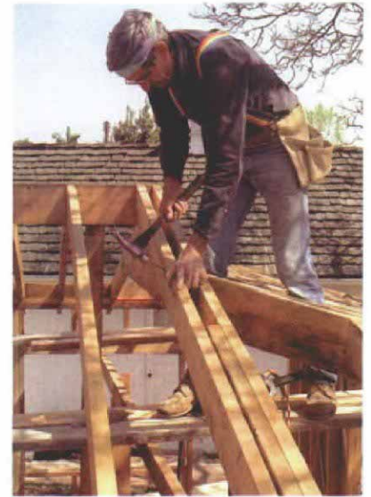
Double the first gable for support. The gable end supports the hip roof, so a second set of gable commons is installed. The gap is filled with 2x blocking.

cuts of the hip rafters, and they're spiked in place with two 16ds.