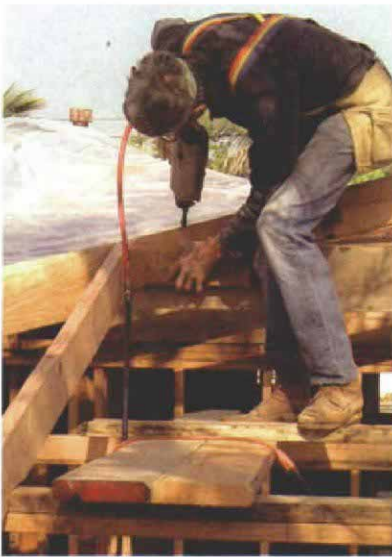
Blocking prevents twisted rafters. The author nails a 2x pressure block to the Dutch ridge. A pressure block goes between all of the Dutch commons.