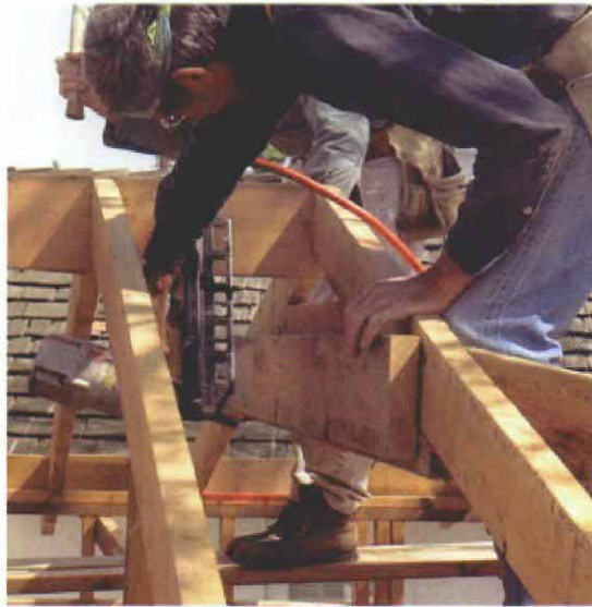
2x6 backing strengthens the Dutch ridge. Because the Dutch ridge only was nailed under the gable commons, a backing ridge is face nailed to the gable commons and to the Dutch ridge for added support.