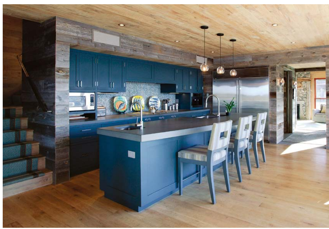
Custom yet classic. The bulk of the kitchen is nestled into a nook toward the north side of the house. Bluestone countertops sit on cabinets painted in Benjamin Moore Navy Masterpiece blue. Using colors reflected in the landscape helps ensure timeless interiors.