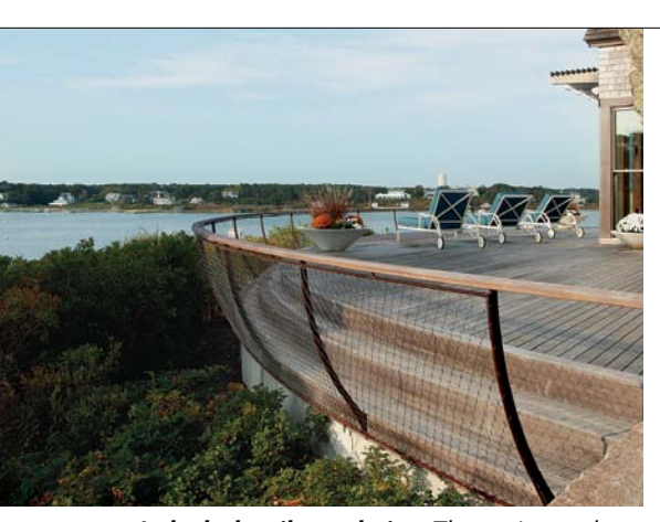
A deck detail to admire. The main outdoor living space, the deck, is designed to preserve the view of the harbor. Locating the railing at the bottom of a series of step seats lowers its overall height—while still meeting code—in order to provide people on the deck and inside with an unobstructed view to the south.

that it would stand the test of time aesthetically, they also wanted it to be responsive to the lifestyles, material innovation, and technology of our time. With a nod to contemporary living patterns, the floor plan features an open L-shaped shared living space. It also provides easy access to the outside. The interior colors—drawn from those of the sea, the shore, and the surrounding flora—help one space to flow into the next, creating a sense of spaciousness.