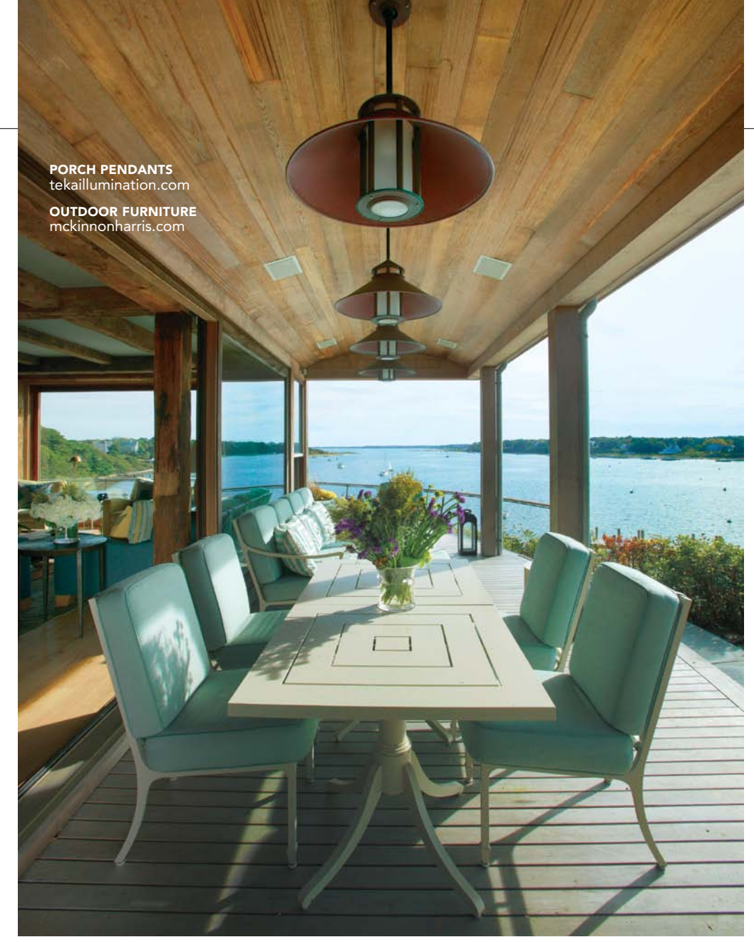
Sheltered. Just off the dining room, a porch offers sitting space to watch views of the setting sun to the west. In the outdoor dining area, meals are lit by large Beacon pendant lights by Teka Illumination that are suspended from a barn-board-covered vaulted ceiling.

The home's attitude toward outdoor living may be one of its more modern marvels. The combination of the deck to the south, the porch to the west, and a fireplace patio to the east roughly doubles the shared living space. Taking full advantage of a 270° water view, the deck's curved edge follows the nearby conservation land's boundary. In a stroke of design brilliance, the team mounted the guardrail at the bottom of a series of step