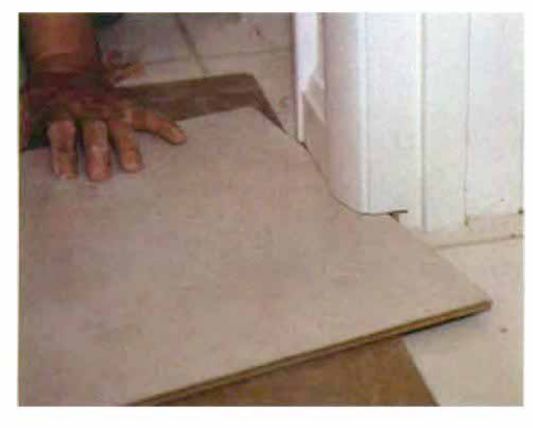
Checking the fit. After cutting the door trim and removing the waste with a hammer and chisel, installers make sure that the laminate flooring and underlayment will fit neatly into the space.