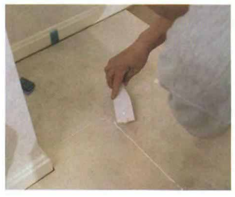
Wipe off excess glue and check the joint. A plastic putty knife makes a good tool to clean excess glue off the flooring. Follow with a damp, not wet, terry-cloth towel; too much water in the towel will dilute the glue and weaken the joint.