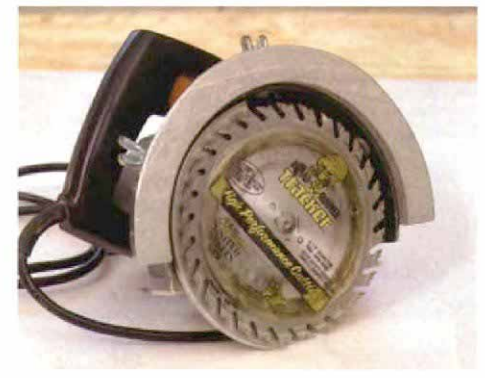
To conceal the expansion gap, the door trim must be undercut with a jamb saw. To hide the necessary \frac{1}{3} in. expansion gap in places that can't be covered with shoe molding, installers use a special circular saw to cut the door trim at a precise height (photo left). These specialty saws (photo right) have no base plate, and instead bear on the flattened edge of the blade guard. Both the blade's height and cutting depth are adjustable.

owners really appreciate this, and it takes only a few minutes.