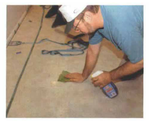
Window cleaner and a towel clean glue haze. After the clamps have been removed, the residual glue haze must be cleaned off before it dries completely. A 1:5 solution of vinegar and water works just as well as the window cleaner.