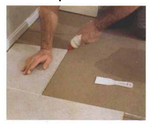
Glue is critical to the flooring's success. Holding the glue bottle at a slight angle is an easy way to control the application of glue. A second bead along the mating tile's edge ensures a tight, waterproof bond. Gaps in the glueline can cause the flooring to fail.