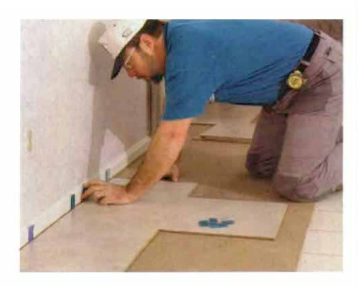
Dry-fitting the first two rows. It's important to make cuts and check the fit of the laminate before gluing. Numbering the back of the laminate helps to keep the pieces in sequence. This is also a good time to check for defects.