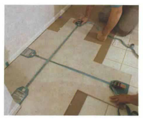
Strap clamps keep joints tight, courses straight. All laminate flooring requires some clamping to tighten glue joints. Specialized clamps can apply pressure over spans of up to 15 ft. or more. As long as the joints are tight, the tile edges will align themselves.