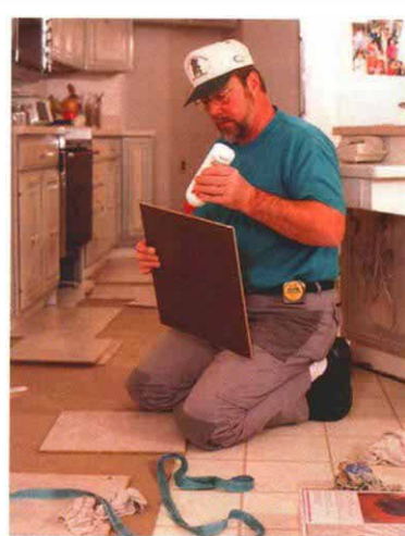
Glue makes laminate flooring work. A special PVA-type glue bonds and permanently seals the surface. The edge-glued flooring floats on the existing subfloor.

the advent of high-pressure melamine laminate flooring in 1977, the industry's pace quickened to a fast gallop. Originally developed in Sweden by the Perstorp Corporation, laminate flooring was introduced to the U.S. market in 1994. I'd been a flooring contractor for over 25 years, and