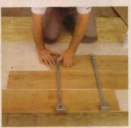
Stagger plank joints when establishing the starter course. When laying plank floors, always build a starter course of three rows, staggering the butt joints by at least the width of the plank. Specialized bar clamps draw the glue joints together.

Installing laminate planks requires a few different techniques than those that are used for tiles. To reduce the visibility of the joints, I install planks to run parallel to incoming natural light; in artificial light, I place them along the longest wall.