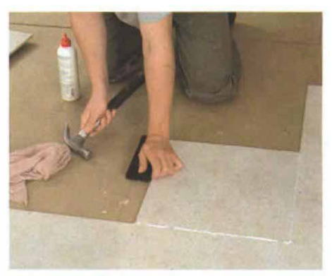
A few careful taps with a hammer and block can close gaps. One way to tighten flooring joints is to use a hammer and a plastic tapping block, which is made to fit the flooring's edges. However, tapping too hard can dislodge other joints.

ply the glue in a smooth line. I fit the groove into the mating tongue and push.it tightly into place. At this point, the glue must ooze up on the surface of the floor in a continuous bead (photo right); if there are gaps, I pull the panels apart and add a little glue to those spots.