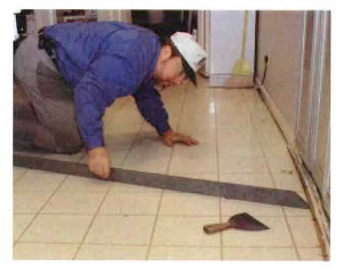
Make sure that the existing floor is flat. After it is cleaned, the floor must be checked for flatness with a straightedge or a chalkline. Any floor deflection of ¼ in. or less over 10 ft. is acceptable.