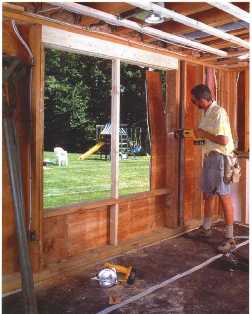
Let there be light. After the sheathing is nailed off around the perimeter of the opening, a reciprocating saw is used to cut back the sheathing, and the opening is ready for the new windows.