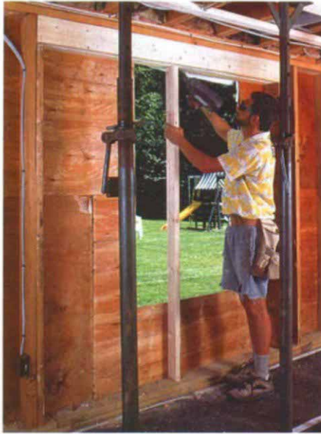
Center jack gives 2x6 header a boost. Because the 2x6 header is not big enough to span the opening without help, a center 2x4 jack stud is installed before the screw jacks are removed.

The final step is popping in the windows. The job should take no more than a couple of hours, even with an editor following you and taking photographs. With a little care and planning, I had to use only four new 2xs. And for the clients who'd been kept in the dark for years, the effect of extra windows in the room was, as always, dramatic. □