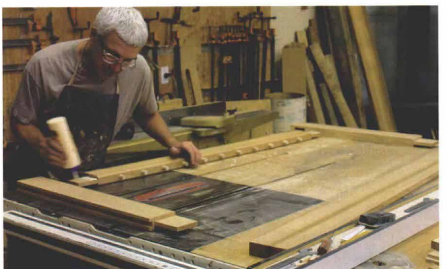
Waterproof glue binds the mortise-and-tenon joinery. The sections are clamped until the glue sets.

Holes on the top, dowels on the bottom. Before the frames are assembled, provisions are made for pipe spindles, which fit into holes in the top rail. On the bottom rail, the spindles slide over dowels (photo left). A hole saw reduces the dowels' diameter to that of the pipe.