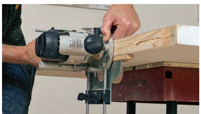
Cut a groove. Using a fence and a <sup>3</sup>/8-in. straight bit, cut a groove in the bottom of the door for the plastic floor guide that keeps the door centered in the pocket. Taking several passes ensures the right depth without overheating the bit.