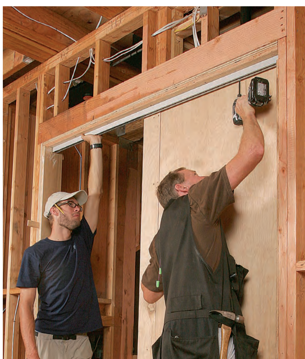
Install the track. Fasten the track to two layers of \frac{3}{4} -in. plywood attached to the bottom of the structural header. The plywood provides a straight, twist-resistant surface and bridges the gap that's in the center of a two-ply header, which is where the trackmounting screws go.

Fasten the strike jamb. Using opposing shims, plumb the strike-side jamb, and fasten it every 8 in. with pairs of trim-head screws. A 6-ft. level ensures that the jamb is straight throughout its length so that it will make full contact with the edge of the door.