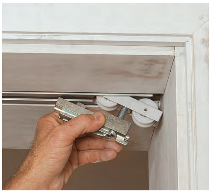
Plan for repairs. Create an opening in the track with a ½-in.-dia. carbide-tipped router bit so that the rollers can be replaced if necessary. Since the roller doesn't reach the opening even when the door is fully closed, the door's operation is unaffected.