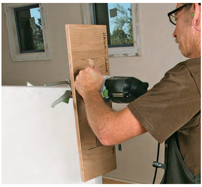
Prep the door for hardware. The HAWA 80 has two aluminum U-channels for receiving the hanging hardware. A plywood template clamped to the door and a router with a top-guided pattern bit and guide bushing create a pair of accurate mortises.

Help with heavy doors. Fastened with four screws, the 1-in.-wide by 1½-in.-deep U-channels receive the rollers and make it easier to hang the door.