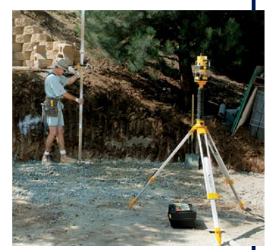
DOT LINE ROTARY

hen my editor asked me to do a head-to-head test of laser levels, I was confused. I explained that there are three general types—dot, line, and rotary—with dozens of models to choose from.