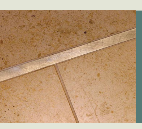
Emphasize the space. Horizontal bands of mosaic tile draw the eye toward the shower, where reflective glass tiles bounce the light around and wallhugging showerheads intrude minimally on the space. Aluminum strips in the floor add an edgy overtone. Photo taken at C on floor plan.

Charles Miller is special-issues editor. Builder: Charles Edward Inc.