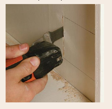
Precise cuts. Long, thin, end-cut blades allow for controlled plunge cuts in everything from drywall to flooring.

others are closer to a hacksaw. Match the blade to the task and to the material being cut, and set the tool to a high speed.