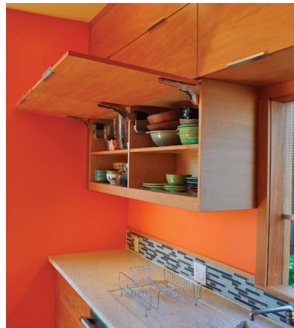
Cohesive cabinetry. Custom cabinets with lift-style doors and smooth-operating Blum hardware have a modern flair. Their horizontal proportion creates a linear grid of functional storage that complements the clean lines of the kitchen.