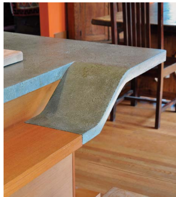
Elegant transitions. The sweeping concrete curve linking the island top to the Douglas-fir bar highlights the creativity in the design and construction of the kitchen.