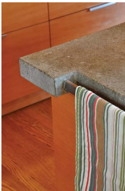
A better towel bar. Integrating ordinary storage solutions into a concrete countertop makes even a towel bar seem unique and interesting.