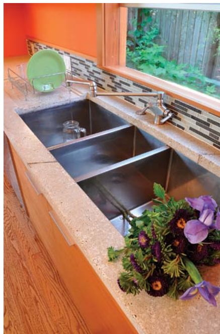
Triple sink. A deep stainless-steel sink sits beneath an articulating faucet and a custom concrete countertop with integrated drain board. The sink has three compartments for maximum utility, with one bowl directing gray water into the garden.

The trick in making a kitchen an extraordinary space lies in the details of its design. While functionality should be a driving force, achieving practical results in creative ways personalizes the space and makes it truly special.