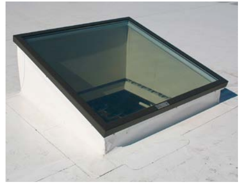
Angle matters. To shed water, most skylights must slope at least 15°. On this flat roof, angling the skylight's curb achieves the necessary pitch.

EAST Sited in the direction of the sunrise, east-facing skylights bring in morning light without much risk of unwanted afternoon heat gain.