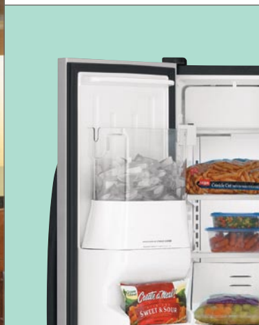
CUBE STORAGE IN THE DOOR New models store ice in the door rather than taking up main freezer space. The in-door cube bin lifts out for filling your cooler.

Gary Kull, of Grants Pass, Ore., bought the zigzag-interior Maytag Wide-By-Side (photo top right, facing page; starting at $1,450) "because it was about 2 cubic feet bigger than the other side-by-sides we saw. We're saving money because we can fit giant jars of condiments. We keep platters and big casseroles on the top three