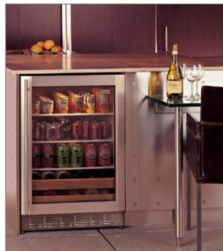
BEVERAGE BAR Cold drinks are close at hand with an undercounter fridge fitted with can shelves and bottle racks.