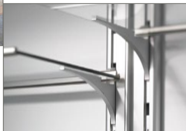
HIGH AND LOW SHELVES Split shelves adjust for items short to tall. They can also be lined up for full-width food storage.