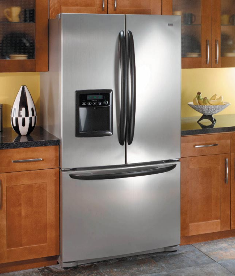
ARE THREE DOORS BETTER THAN TWO? The latest model to gain popularity is the French-door fridge, which features a full-width, double-door fresh food compartment with a freezer on the bottom. Chances are, you'll always open both refrigerator doors.

tors offer the most models, sizes, and prices. The wide interior makes it easy to reach the back, but doors swing wide into kitchen aisles, and you have to bend to reach the bottom shelves.