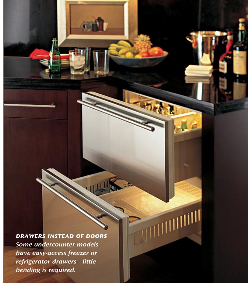
DRAWERS INSTEAD OF DOORS Some undercounter models have easy-access freezer or refrigerator drawers—little bending is required.

Which fridge should you choose: a side-by-side, a top-mount, or a bottom-mount? Each has its pros and cons. To narrow the field, consider your budget, your kitchen layout, and what you store. The choice of two-thirds of buyers, top-mount (freezer on top) refrigerator