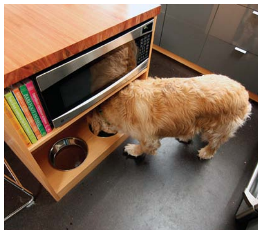
Clever island assembly. The butcher-block island top was made by butting together two counter-depth pieces. The base is made from a pair of Ikea drawer units. Custom shelves at one end hold the microwave and bowls for the dog's food and water.