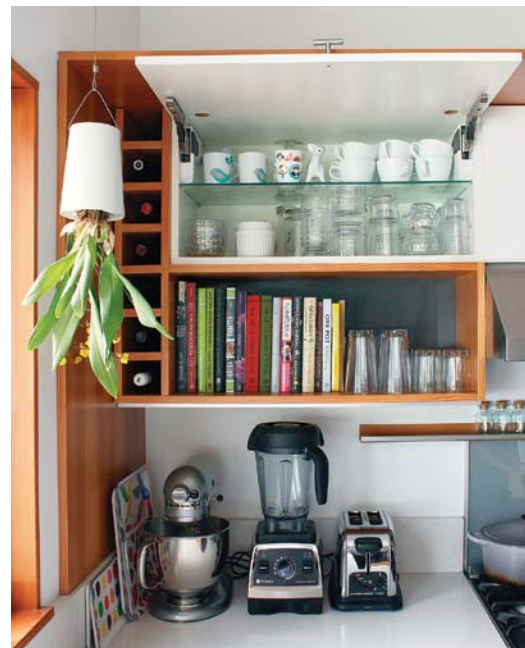
Budget custom. Ikea cabinets were integrated with open shelving the Zerbey's built to create a more customized look. Fir plywood on the side and top of one wall of cabinets helps to define that zone.

Lauren and Kyle Zerbey run Studio Zerbey, an architecture and design firm in Seattle.