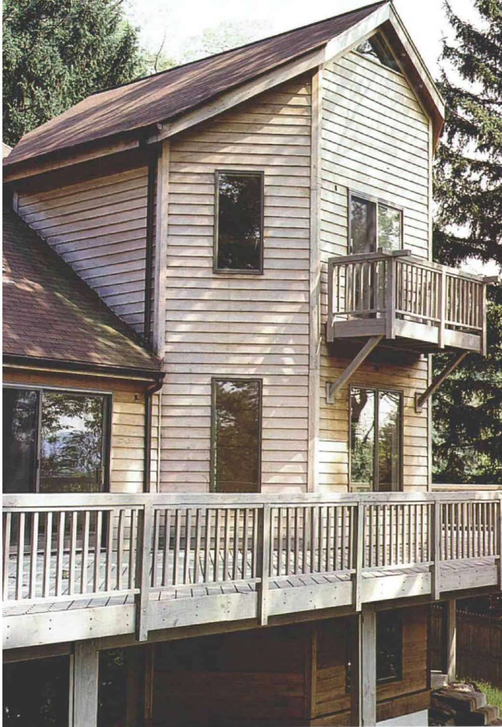
Lopping off the corners. This octagonal room is sheltered by a gable roof that has its four corners lopped off. To find the best way to frame the intersection of the rafters and the sloping, angled eaves walls, the author framed each of the four corners a different way.

Because the outside corners of the falling headers were aligned with the level eaves plates at their lower ends, they could not align with the gable-wall top plates at their upper ends and remain parallel to the roof surface. This is because the gable-wall top plates were recessed below the roof surface by the full vertical depth of the rafters (to make room for the lookouts). However, the eaves-wall plates were recessed below the roof surface by the raising distance (the vertical depth of the rafter above the plate). The raising distance takes up only part of the vertical depth of the rafter, with the heel cut of the bird's mouth taking up the remainder (drawing detail next page). Therefore, the top ends of the falling