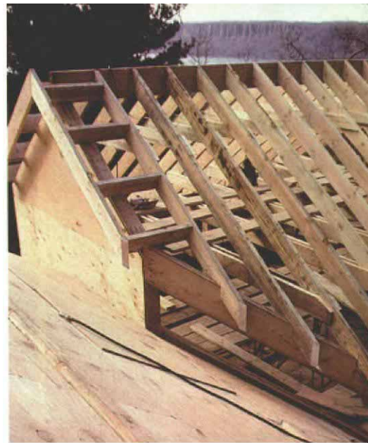
Gable overhang. The gable walls were shortened an extra few inches to allow for 2x10 lookouts, which cantilever beyond the walls to form the overhang. This framing assembly is called a ladder.

The raised-block method— Because I'm used to seating the lower ends of rafters onto a level surface, I first tried building up level bearing on one of the falling headers by adding triangular blocks (bottom photo, right). To lay out the spacing for the jack rafters, I pulled 16in. centers from