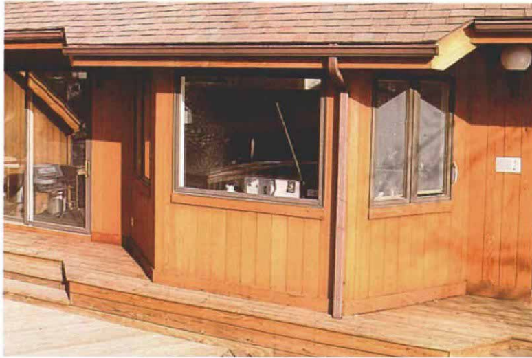
When an angled bay is capped by an extension of the main roof, the rafters that sit on the angled walls require some careful cuts.

One carpenter tries five methods of framing a tricky roof