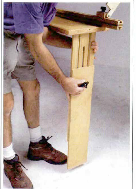
6. Height adjustment at the turn of a knob. A hardwood runner riding in a router-cut groove keeps the two parts of the legs aligned as they adjust to the desired height. A single knob locks them in position.

aligned with the saw, I left the rod sections inserted in the saw base while the epoxy set up. If your saw does not come with predrilled holes, there is an alternative: You can attach a block to the saw base and then bolt the tables to the block (photo top center).