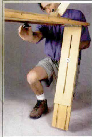
5. Piano hinge joins the leg to the table. The leg folds flat for convenient storage. Here, the author tightens a knob to lock the fence in place.