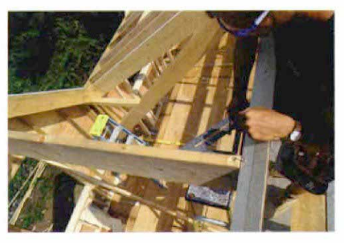
Corner of the valley. Angles that are taken on each side of the string determine the corner cuts that are needed for the ends of the valley rafter.