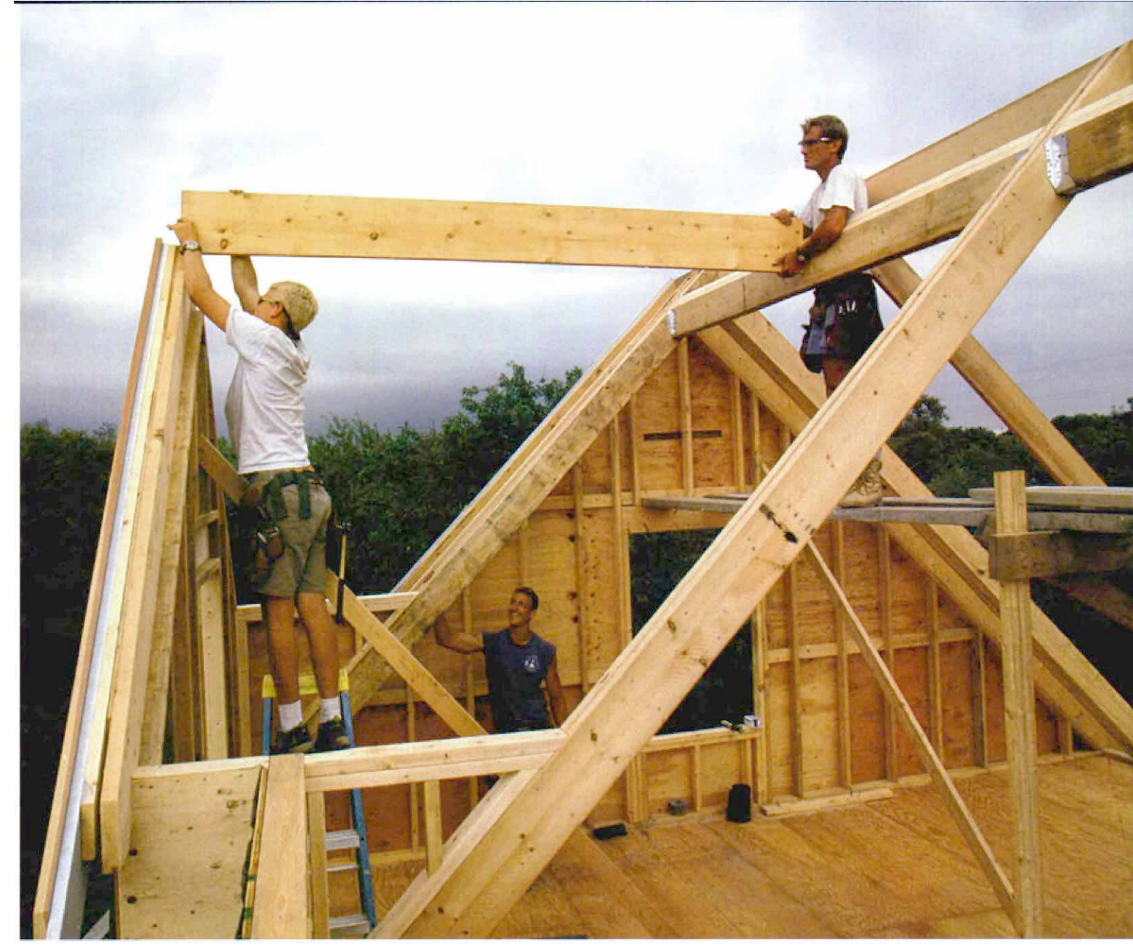
Doghouse ridge drops in. The doghouse ridge connects the outer wall of the doghouse dormer to the header.

interiors. The difference, roughly speaking, is that one method uses structural rafters and the other uses structural valleys.