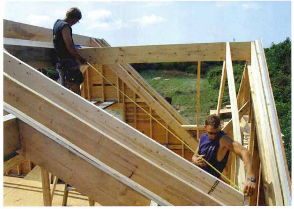
Measuring an irregular valley. The quickest way to figure out the irregular valley is to stretch a line from corner to corner. Here, a measurement is taken along that line.

Another complication caused by the differing roof pitches is getting the planes of the cathedral ceiling inside to line up. Obviously, a 2x10 rafter meeting a valley at a 12-in-12 pitch will do so at a much different depth than one meeting it at a 7-in-12 pitch. The simplest approach to this problem is to increase the size of the framing material for