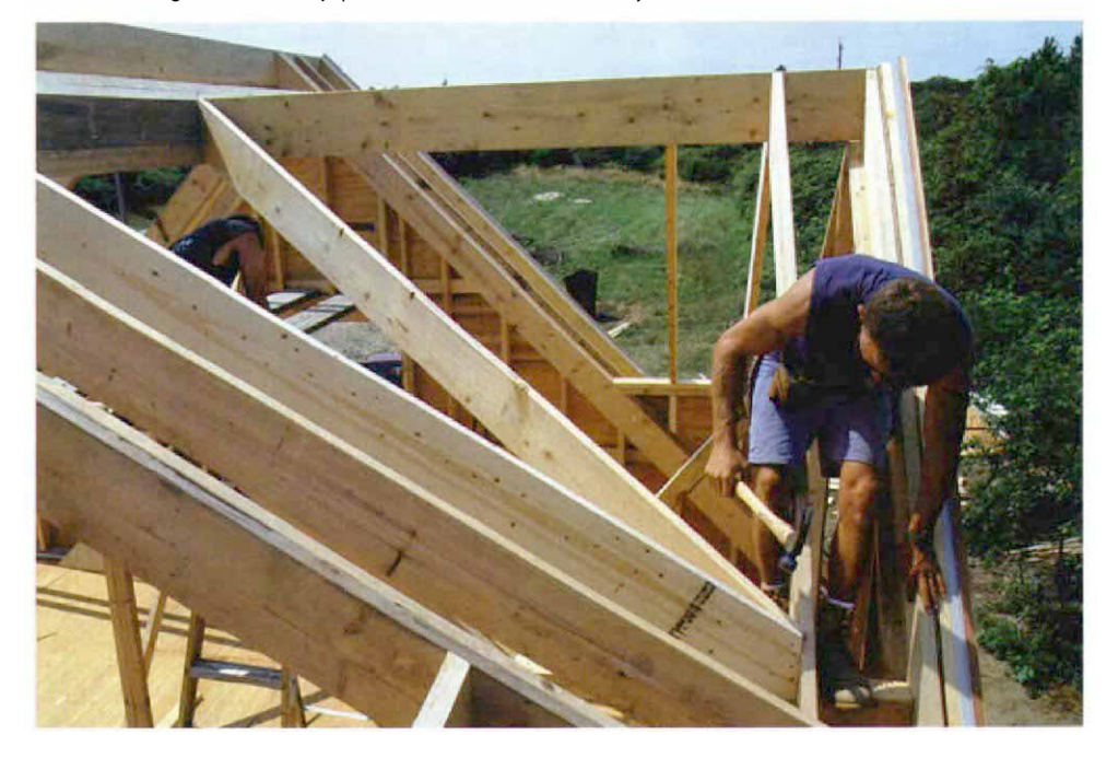
Valley rafter slips into place. After all the angles have been cut into the valley rafters, including a bevel on the bottom edge where the ceiling planes intersect, the valleys are nailed in permanently.