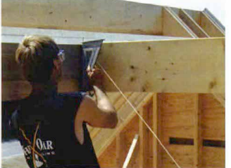
Finding the plumb cut. A rafter square held in the corner against the string determines the angle of the valley plumb cuts.