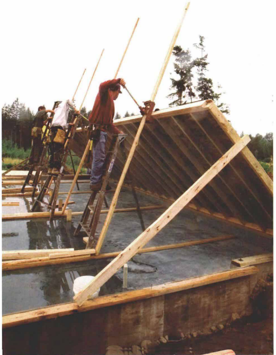
TWO TYPES OF WALL JACKS

Twenty years later, I still depend on these simple tools to lift walls that weigh thousands of pounds. Pumping a lever actuates a mechanism similar to a scaffold pump jack (photo right). This action