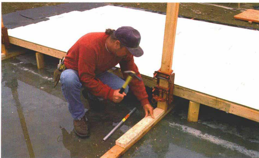
A scrap block keeps the jack post from kicking out. When working on a slab, the author fits 2x4s snugly between the mudsills or stemwalls. These 2x4s provide nailing for the anti-kick-out blocks.