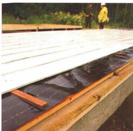
Leave off the bottom siding courses so that the sheathing can be nailed. The sheathing hangs below the wall plate to lap the mudsill or rim joist.