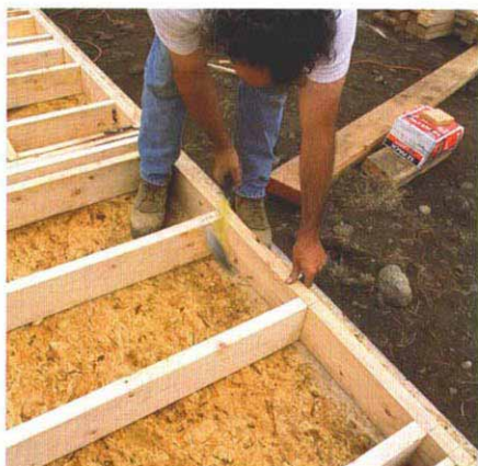
Toenails keep the wall's plate from kicking out. With the bottom plate on the layout line, the author toenails the plate to the subfloor.