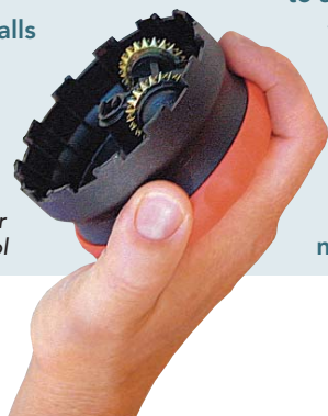
Paper Tiger scoring tool

With the right prep, the wallpaper may peel easily off the walls. If it needs a little coaxing, use a scraper with a sharp blade. Be sure to remove all the glue before painting.