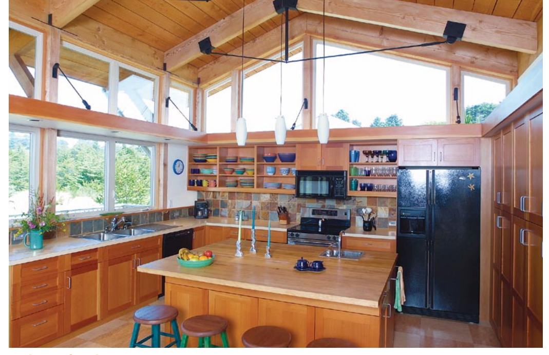
Lighting for day, night, and stormy weather

To stand up to the corrosive salt air, all the exterior light fixtures are made of natural brass, and the exterior hardware is made of stainless steel.