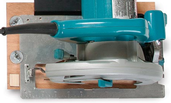
Quick clamping and a carriage for a plywood platform. The Red-Line clamp (photo top left) is one of the best. The carriage is designed to hold a ¼-in. plywood zero-clearance base for a circular saw or router. Slick plastic inserts promote smooth movement (photo right). Unfortunately, the carriage has to slide on and off the end of the fence. Joining fence sections together involves tightening six setscrews (photo bottom left).