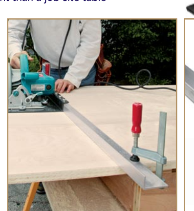
Clamps cost extra; fence connections are easy. You have to supply the clamps for the Tool Trolley, but the offset carriage means that they won't get in the way. Thanks to registration pins on the connector plate, fence sections are coupled quickly by tightening a pair of setscrews.

saw, at about the same cost as an optional/aftermarket outfeed extension alone. Its fences are rigid and straight, and the roller carriage tracking is smooth and true. Tool attachment is simple and precise; the baseplate's multiple holes will accommodate any circular saw I can think of; and the mounting process is slick and easy. Having to pony up for a couple of small bar clamps wouldn't bother me that much because clamps are a good investment anyway. (Am I