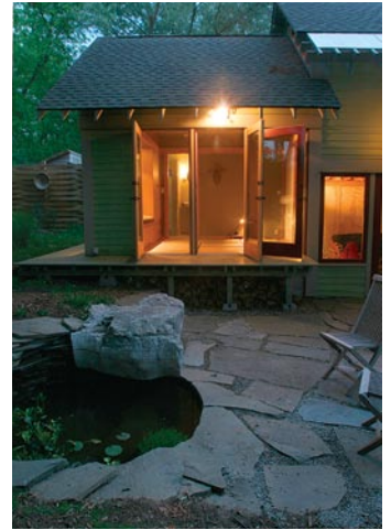
Breaking the barrier between indoor and outdoor spaces. The tatami room's three doors open to the deck and patio, expanding the room's feel. Photo taken at F on floor plan.

toilet. This door does double duty as a cabinet door, covering storage shelves above the toilet when open and allowing access to them when shut.