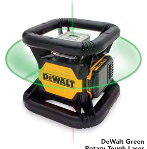
DeWalt Green Rotary Tough Laser $1600 (with battery and charger)