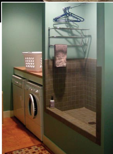
Mudroom shower. Next to the laundry, an elevated mini-shower stall makes a handy place to hang wet clothes, hose off muddy boots, or wash the dog. Photos taken at E on floor plan.