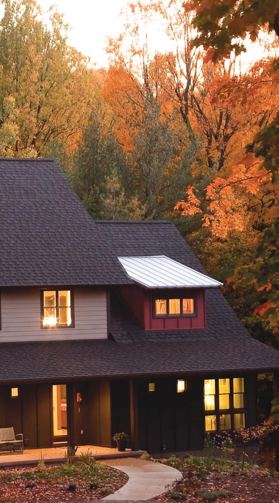
A contemporary farmhouse. Fiber-cement siding painted with complementary colors and a roof composed of contrasting materials energize this classic image of home. The garage is a separate building, adding to the farm-compound look. Once her design came together on paper, the author built this foam-core model (right) to evaluate the composition. Photo taken at A on floor plan.