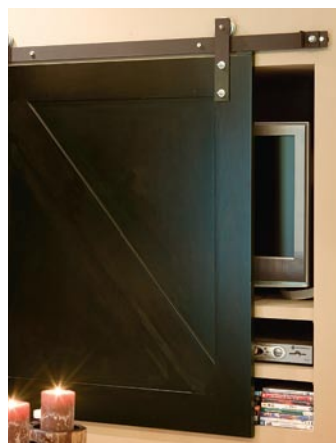
Multipurpose room. Long diagonal views through the doors to the screened porch extend living-room sightlines. Slide open the barn door on the north wall, and the formal living room turns into a TV/family room. Photos taken at D on floor plan.