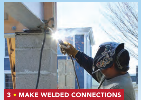
The I-beams and any shims under the beams are welded to the embed plates by the steel crew using an arc welder. Once welded, the joints are cleaned of welding slag and then sprayed with a corrosionresistant primer to prevent rust.