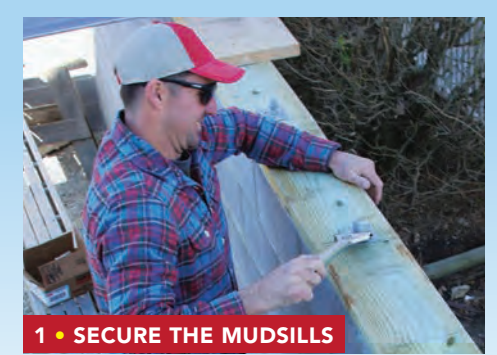
The anchor bolts have 2-in.-square washers to prevent the bolts from pulling through the mudsill with high winds or flood water. This foundation was within \frac{1}{8} in. of square and level, so we were able to bolt the mudsills to the foundation without shims.

Sturdy connections where different parts of the house come together are critical for the house to withstand the stress of high winds and water. The engineer and architect specify the connection details. The steel subcontractor and our framing crew build to the plans, and the local inspector checks the work as part of the framing inspection.