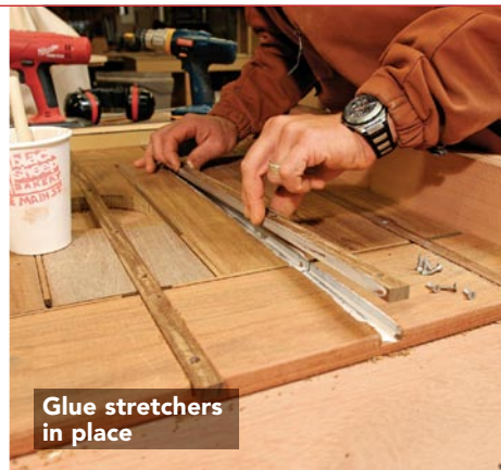
Glue stretchers in place