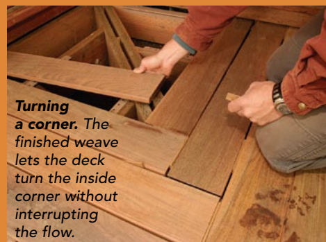
Turning a corner. The finished weave lets the deck turn the inside corner without interrupting the flow.