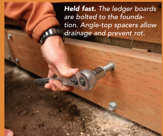
Held fast. The ledger boards are bolted to the foundation. Angle-top spacers allow drainage and prevent rot.

With the deck so close to the ground, the beams sat right in the post bases. I put the bases on the beam first and then, using a stringline, a laser level, and some stakes, set the beams for final placement. With the beams in place, I filled the footings. While the concrete cured, I measured and cut the joists, returning the next day to install them.