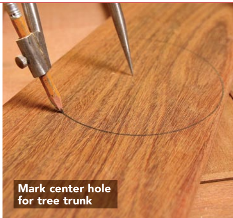
Mark center hole for tree trunk