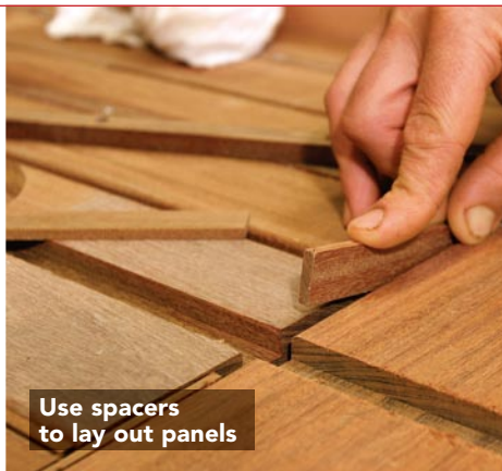
Use spacers to lay out panels