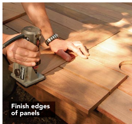
Finish edges of panels