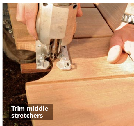
Trim middle stretchers

The finished panels have framing support on all sides except where they meet in the middle. Where the two panels meet, I screwed a 1x2 on the bottom side of one panel to support the other panel.