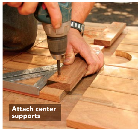
Attach center supports