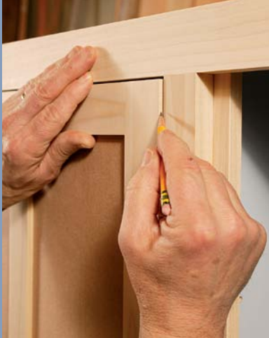
When a door goes wrong. A warped door won't land evenly on the strike side and may protrude beyond the face frame at the top or bottom.