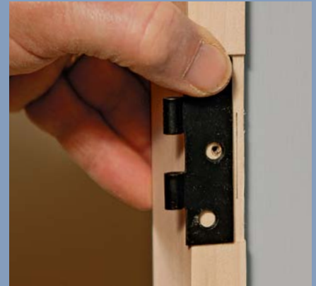
Shift one hinge. By moving the location of the hinge diagonally opposite the problem corner, it's possible to make the door land evenly on the strike. Mark the leaf location before moving it.

If you can't get all the way there by adjusting the hinge positions, plane the back side of the door where it first strikes the stop. Reducing the thickness of the door by a few passes of a plane shouldn't be visible to the casual eye.