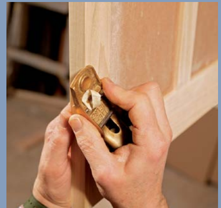
Reduce the door. The alternative is to plane the back side of the door where it hits the strike until the entire side hits evenly.

and sometimes more accurate to do at least some of the cutting on a tablesaw and, if you have access to one, a jointer. The tool choice is yours.