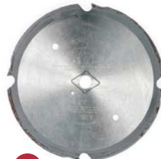
6 Oshlun SBH-072504

Like its two Gila siblings, this reasonably priced blade was an above-average performer. It cut cleanly and tied for sixth in overall endurance.