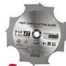
7 Gila PCD7250T4-P

This solid, middle-of-the-pack blade turned in respectable numbers for endurance, cutting quality, and cost-effectiveness.