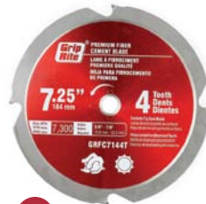
8 Grip-Rite GRFC7144T

This solid, no-frills contender cut adequately and turned in good endurance numbers, but its sticker price is too high to make it a great value.