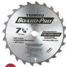
21 Tenryu BP-18524

While all the blades performed adequately out of the box, the true test was how much they cut. We ranked the blades based on their price per cut foot. In a few instances, a lower-ranked blade cut more lineal feet than the blade ahead of it, but that's a misleading statistic when you consider the price of the blade.