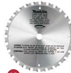
19 Makita A-90451

I specifically asked for this blade because of my prior positive experience with Oldham's woodworking products. However, reputations don't cut fiber cement. The blade's cutting quality was merely adequate, and it was unable to progress beyond a couple of feet into the stack of three planks.