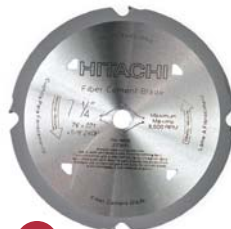
10 Hitachi 18008

Another solid competitor from Gila, this blade finished a whisker behind its four-tooth brother. Perhaps more than any other blade I shopped for, the Gila products showed the widest variation in pricing. Gila's website offered the lowest prices I found anywhere.