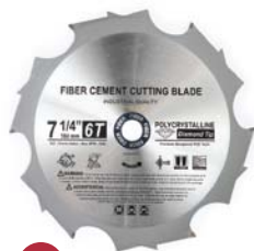
11 Gila PCD7250T6-P

Although capable of cutting a single sheet, Irwin's Marathon blade was unable to advance beyond 4 ft. against the stack of three planks. I was surprised by the wide range of prices I found for this blade. I wouldn't shop around for the best deal, though, because this carbide-tipped offering isn't a good choice for heavy-duty work.