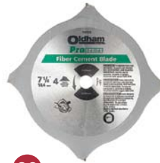
20 Oldham 725FC04

To be fair, this blade was labeled with a reminder that it was designed for cutting single planks, so I wasn't surprised when it scarcely ripped 2 ft. into my stack of three planks. However, it seemed to struggle even during the single-sheet crosscut test, so I'm not confident it will excel in any circumstance.