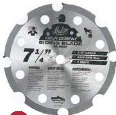
9 Malco FCCB7

Although fairly cost-effective, this blade finished just under the median during the endurance test, and its cutting quality was merely adequate.