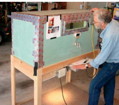
The author tested seven different bulbs in five air-sealing enclosures.