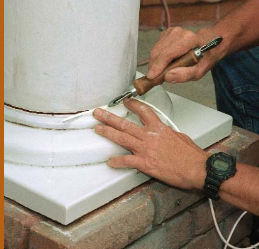
Backer rod should be wider than the joint so that it stays compressed even when the joint is at its widest.

Backer rod is hard to find in stores, but easy to find on the Web. Because it can make the difference between a joint that lasts and one that fails, it is worth searching for.