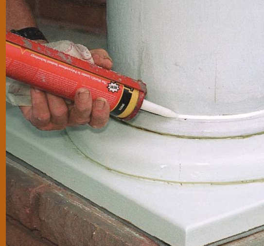
Caulk is applied after the backer rod is in place.

So why bother with polyurethane? Because polyurethanes are the only sealants that can stand up to abrasion. Forget that polyurethanes are paintable, flexible, and weather resistant. There is almost nowhere in residential construction that a safer product cannot be substituted—except for those high-traffic areas. But if you need to seal joints on a floor, on a driveway, or in a garage with frequent foot or vehicular traffic, break out the rubber gloves, the respirator, and the polyurethane sealant.